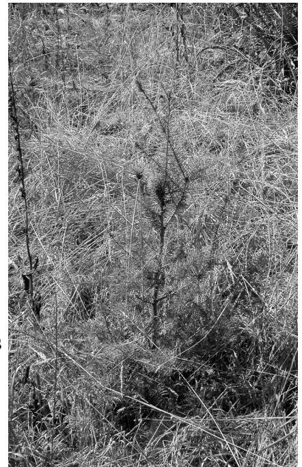
Unflagged trees play hide and seek.