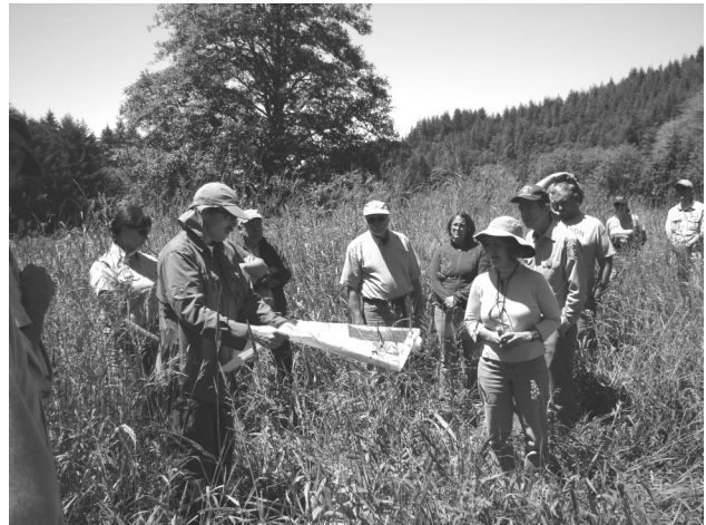
Restoration practitioners discuss potential approaches at Fivemile-Bell.

We will all benefit from your involvement in the process. Please take the time to fill out the enclosed checklists and mail them in or bring them to the May General Meeting. We will be compiling the responses and will use them for the Council Self-Evaluation and to guide and inform the strategic planning process which the SWC will be going through this year. We appreciate your participation in the Council Self-Evaluation.