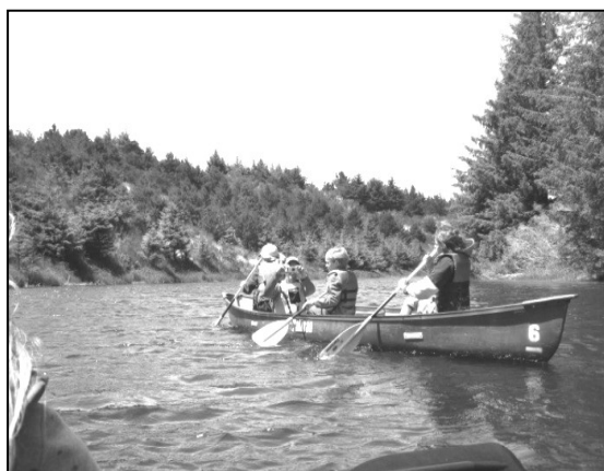
2010 Campers canoeing on Cleawox Lake

Please visit www.siuslaw.org/camps for applications and registration materials. Call 541-268-3044 for more information, or email camp@siuslaw.org . Made possible through grants from the Oregon Watershed Enhancement Board, the Western Lane Community Foundation and private donations and support.