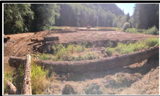
New channel creation, floodplain regrade and large wood placement at Five-Mile Bell