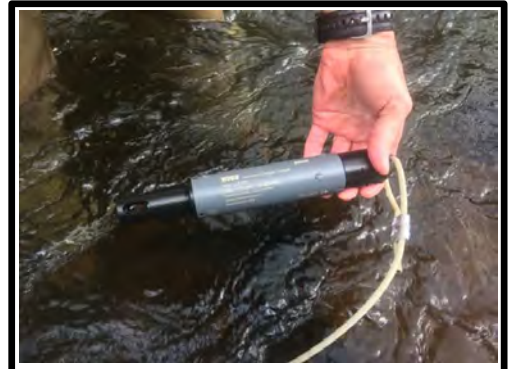
Monitoring Water Quality on the Siuslaw River