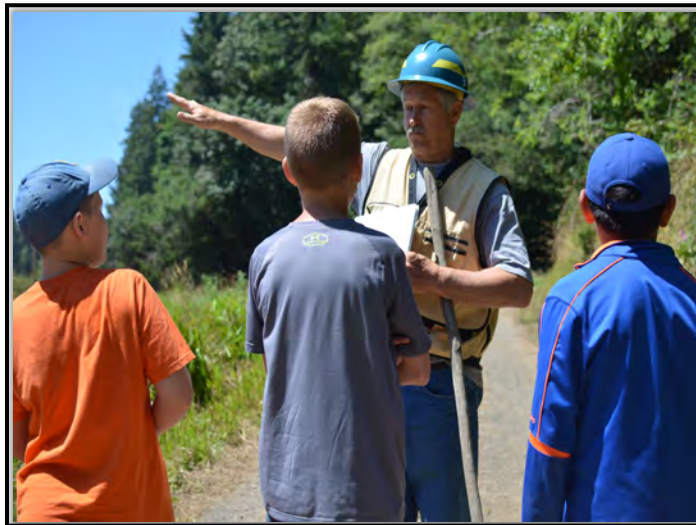
Photograph: Lessons in forestry and natural resources at Intermediate Siuslaw Watershed Camp.

The SWC brings federal, state, and regional competitive grant funding to the Siuslaw and Coastal Lakes in Lane and Douglas Counties.