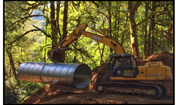
Culvert replacement at Esmond Creek