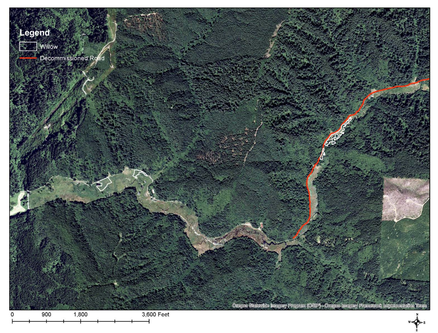
Figure 3 Planting Area