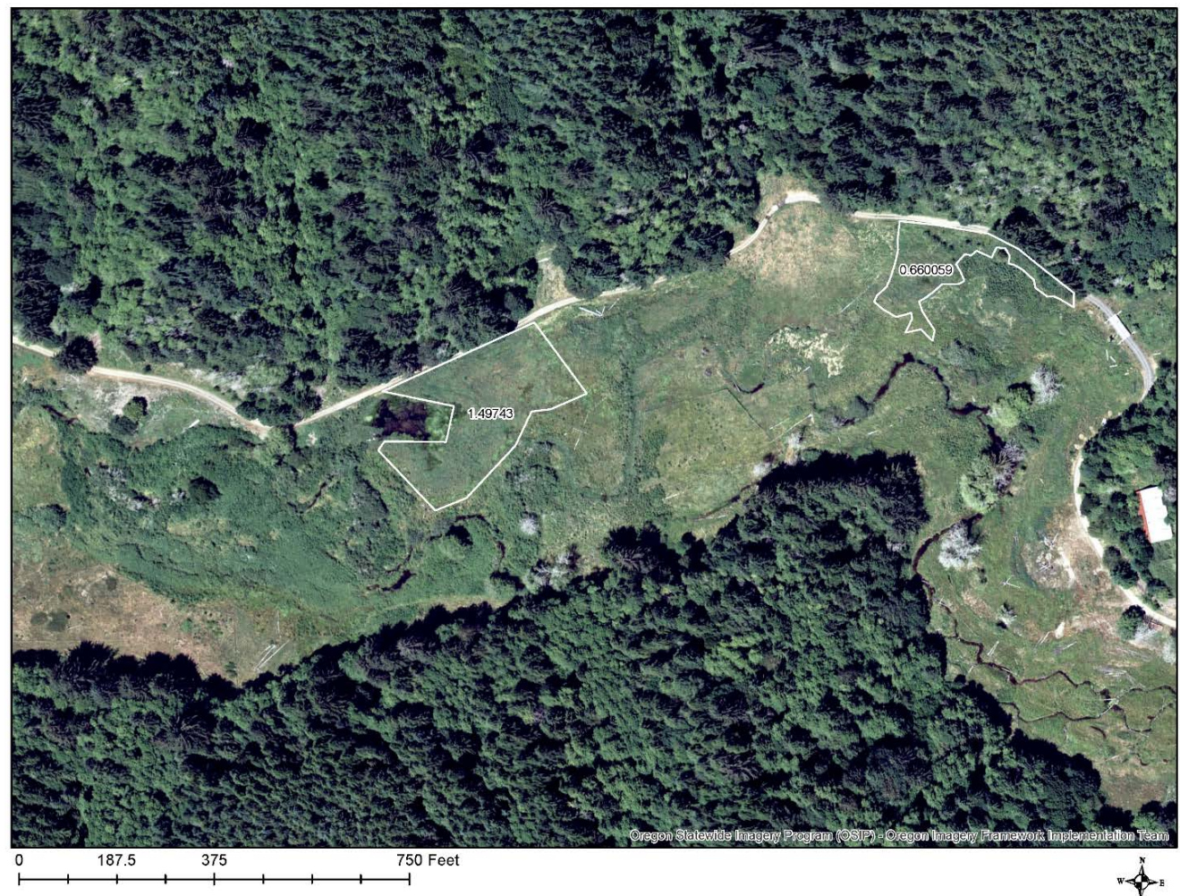
Figure 4 Planting Area