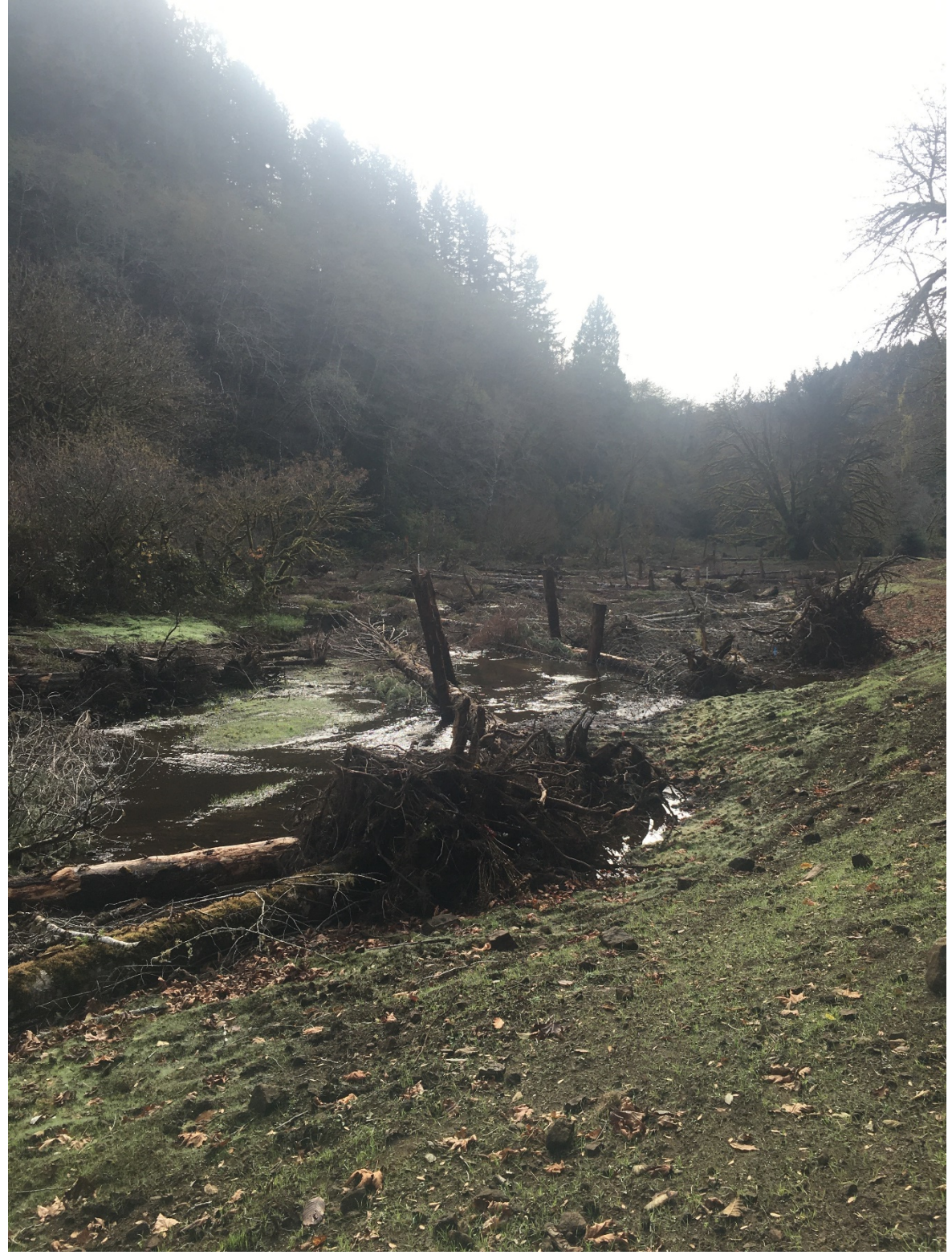
Figure 2 Planting area during base flows, little precipitation leading up to this photo