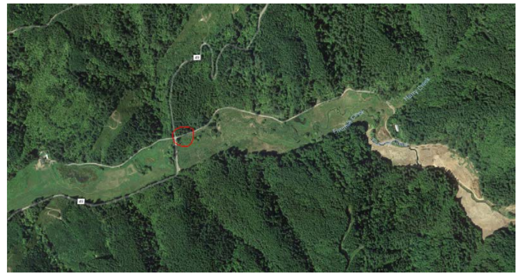
Figure 1 Site visit meeting location.

The SWC will be conducting a pre-bid field tour January 20, 2021 for riparian revegetation associated with the multi-phase Fivemile-Bell Restoration Project on Fivemile Creek. We will meet on site, located at 43.8411348, -124.0411957, across from 9250 Fivemile Rd, Westlake, OR 97493, at 9:00am. We will meet at the gate on the east side of the gravel Douglas County Road 49. The tour will take approximately 2 hours to view the project and answer any questions. Please come prepared for uneven and muddy terrain. Please RSVP by contacting SWC Programs Manager at (541) 268-3044 or programsmanager@siuslaw.org.