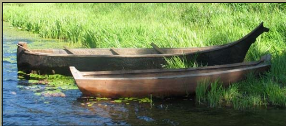
Confederated Tribes of the Coos, Lower Umpqua, and the Siuslaw