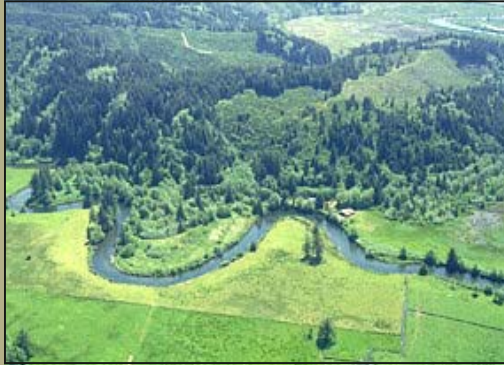
Siuslaw Watershed Council

The Water Trail has over 30 river-miles of paddling opportunities along the North Fork and mainstem Siuslaw River between Mapleton, Oregon and the Pacific Ocean.